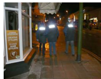
Off down to the harbour for duty, looks like it has stopped raining!