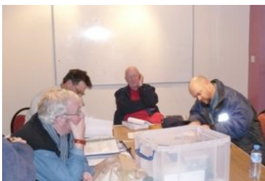
Men at work! Prayer and Street Pastors catching up at break time end of 12-2am shift!