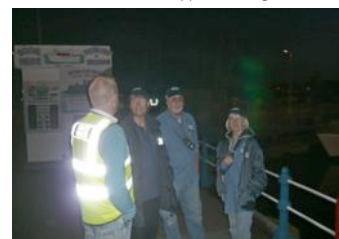
Down at the harbour side showing an observer the "ropes".