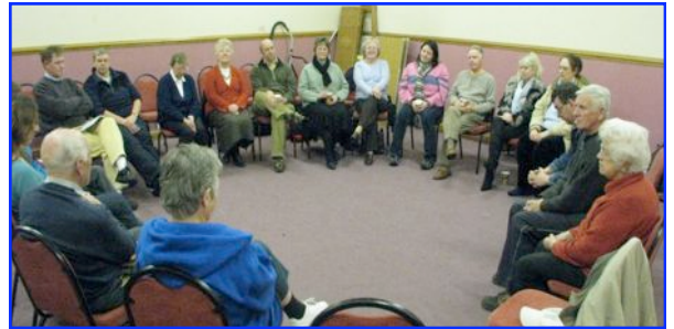
Above: Our Prayer Pastors on Commissioning Night.