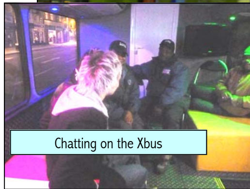
Chatting on the Xbus

Our finances aren't good so we appreciate prayer and giving! We are thankful to have recently received some money from the police which we hadn't even asked for. When they asked 'would we like it?', we had no hesitation in saying yes! In addition we submitted an application for funding to Enfield Council and were pleased to have received the full amount. If this year has been a difficult one the next financial year