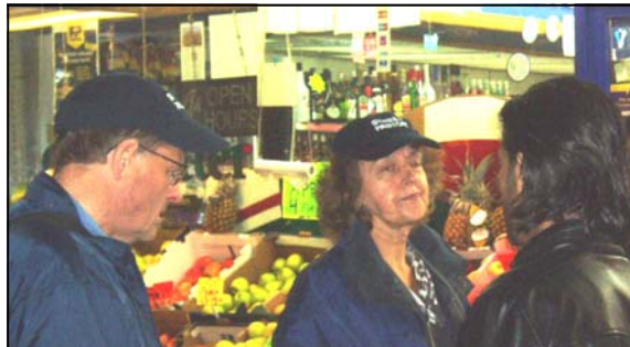
Chatting to shopkeepers